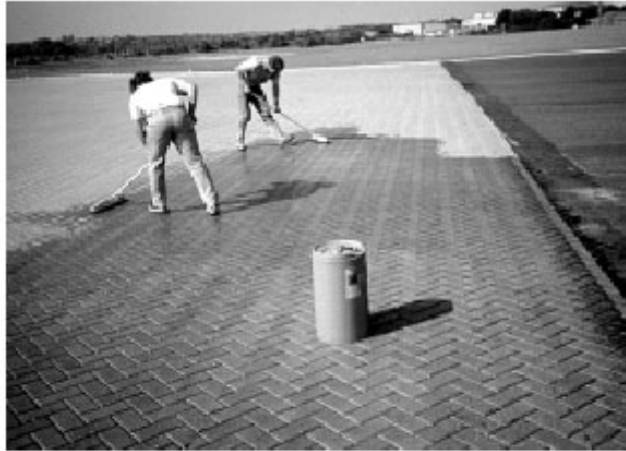
Figure 10. Urethane is applied with squeegees to stabilize joint sand between pavers on aircraft pavement.

concrete while still leaving a slight sheen to enhance the color of the pavers. They generally do not change the skid resistance of the surface. When applied, water based epoxy sealers create an open surface matrix that allows the paver surface to breathe thereby reducing the risk of trapping efflorescence under the sealer should it rise to the surface. They resist most chemicals and degradation from UV radiation. These characteristics make these types of sealers suitable for high use areas such as theme parks and shopping malls. The elasticity and adhesion of these sealers make them appropriate for heavily trafficked street projects and areas subject to aggressive cleaning practices.