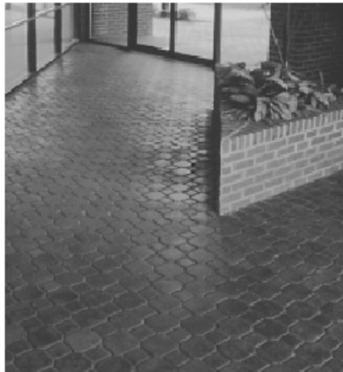
Figure 1. Many sealers enhance the appearance of concrete pavers and protect against staining.

When properly installed, interlocking concrete pavements have very low maintenance and provide an attractive surface for decades. Under foot and vehicular traffic, they can become exposed to dirt, stains and wear. This is common to all pavements. This technical bulletin addresses various steps to ensure the durability of interlocking concrete pavements and to help restore their original appearance. These steps include removing stains and cleaning, plus joint stabilization or sealing if required. Stains on specific areas should be removed first. A cleaner should be used next to remove any efflorescence and dirt from the entire pavement. A newly cleaned pavement can be an opportune time to apply joint sand stabilizers or seal it. In order to achieve maximum results, use stain removers, cleaners, joint sand stabilizers, and sealers specifically for concrete pavers. These may be purchased from a manufacturer, contractor, dealer or associate member of the Interlocking Concrete Pavement Institute.