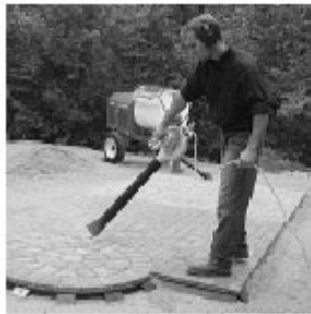
Figure 6. Whether using liquid or dry joint stabilization materials, the surface of the pavers should be cleaned with a blower or broom after the joint sand is compacted into the joints.

pavers (cobble stone-like units) and circular patterns have wider joints than other paver shapes. Tumbled pavers may require stabilized joint sand between them if they have slightly irregular sides and wide joints. Studies on the permeability of the surface of interlocking concrete pavements have indicated ranges between 10% and 20% perviousness (2). The rate of permeability depends on several factors. They include the fineness of the joint sand (percent of material passing the No. 200 or 0.075 mm sieve), the joint widths, slope, consolidation of the sand plus the age of the installation. Newly placed pavers have higher permeability (as much as 25%) than installations trafficked for several years. Sealers and joint sand stabilizers can contribute to long-term performance by reducing infiltration of water to the bedding sand and base.