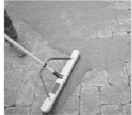
Figure 5. Joint sand can be pre-mixed and delivered to the site (typically in bags), or mixed with stabilizer at the site, then swept into the joints, compacted for consolidation in them to create interlock, and wetted to activate the stabilizer.