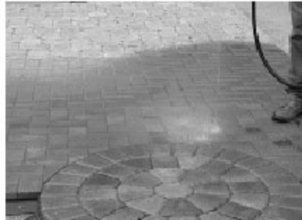
Figure 7. Dry-applied joint sand with a stabilizer is wetted in order to activate it and stiffen the sand. Once the joints dry, they are stabilized.