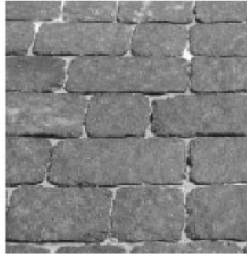
Figure 4. Liquid joint sand stabilizers can deepen the surface color slightly and they provide some surface sealing as well. Tumbled pavers shown here have wider joints than other shapes. These type of pavers can require stabilization of the joint sand.