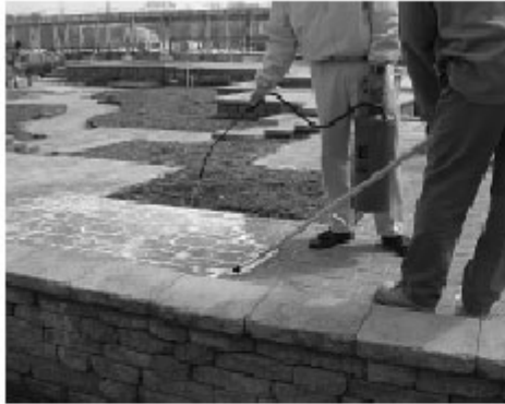
Figure 3. This liquid joint sand stabilizer is applied with a low-pressure sprayer and squeegeed across the surface after allowing some time for soaking into the joints. This helps maintain slip and skid resistance of the paver surface.