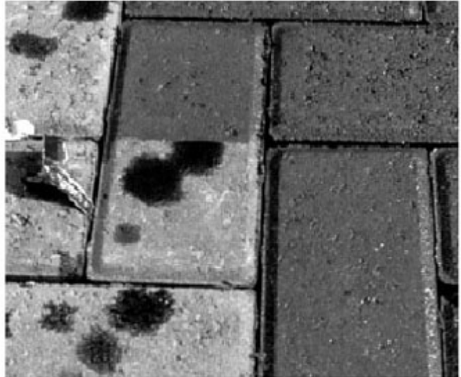
Figure 9. Sealers resist stains which makes them ideal for high use areas where they might occur.