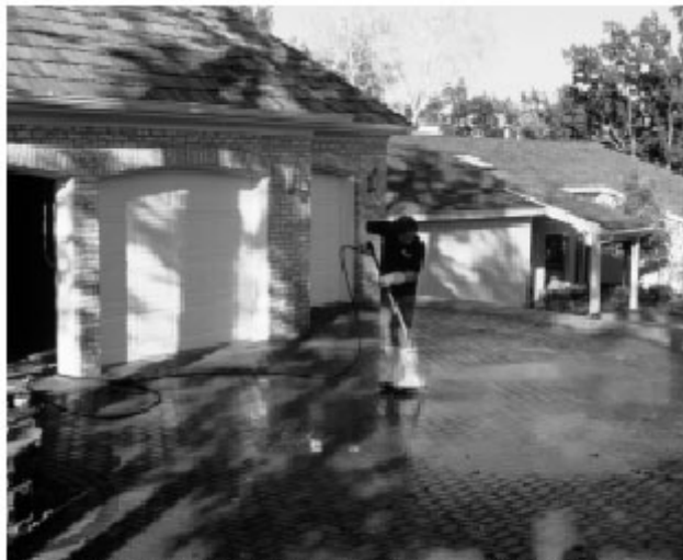
Figure 2. Pressurized cleaning equipment used by professional cleaning and sealing companies can bring out the best appearance from pavers.